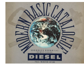
First Diesel J Catalog From Winter 1987

HMS is the only composite/synthetic stone registered on the EIM system with its trademark, plus the only one in the green range. This makes HMS a great pumice alternative for the brands. Using HMS , they can achieve the closest effects to pumice compared to any other alternative in the world.