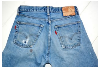
RARE VINTAGE LEVI'S 501 JEANS DOUBLE RED TAB 1960'S