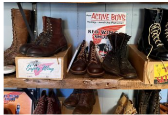
AN EXCLUSIVE LOOK AT KAY KNIPSCHILD'S RED WING SHOES ARCHIVE