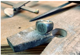
SPECIAL MADE SILVER SIGNET LONG JOHN RING BY 877 WORKSHOP